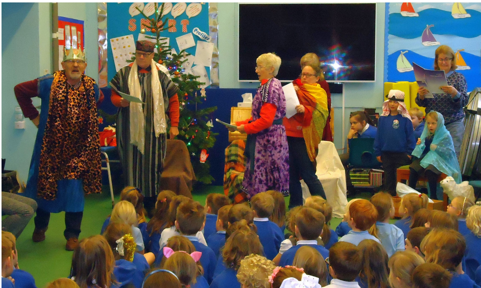
The “Open the book” team in action at Kingswood Primary School

A guide to some of the events and services organised by the churches in Kingswood supporting our mission and ministry here and across the world.